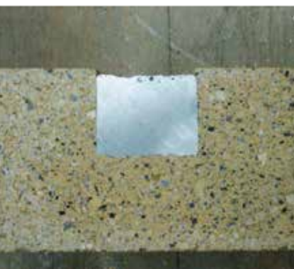
Brick AK 85 P1