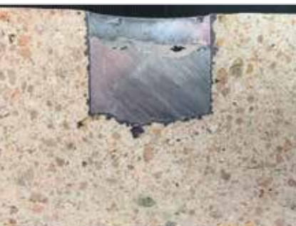
Alloy 7075 (5% Mg)/1.200 °C/72 hours